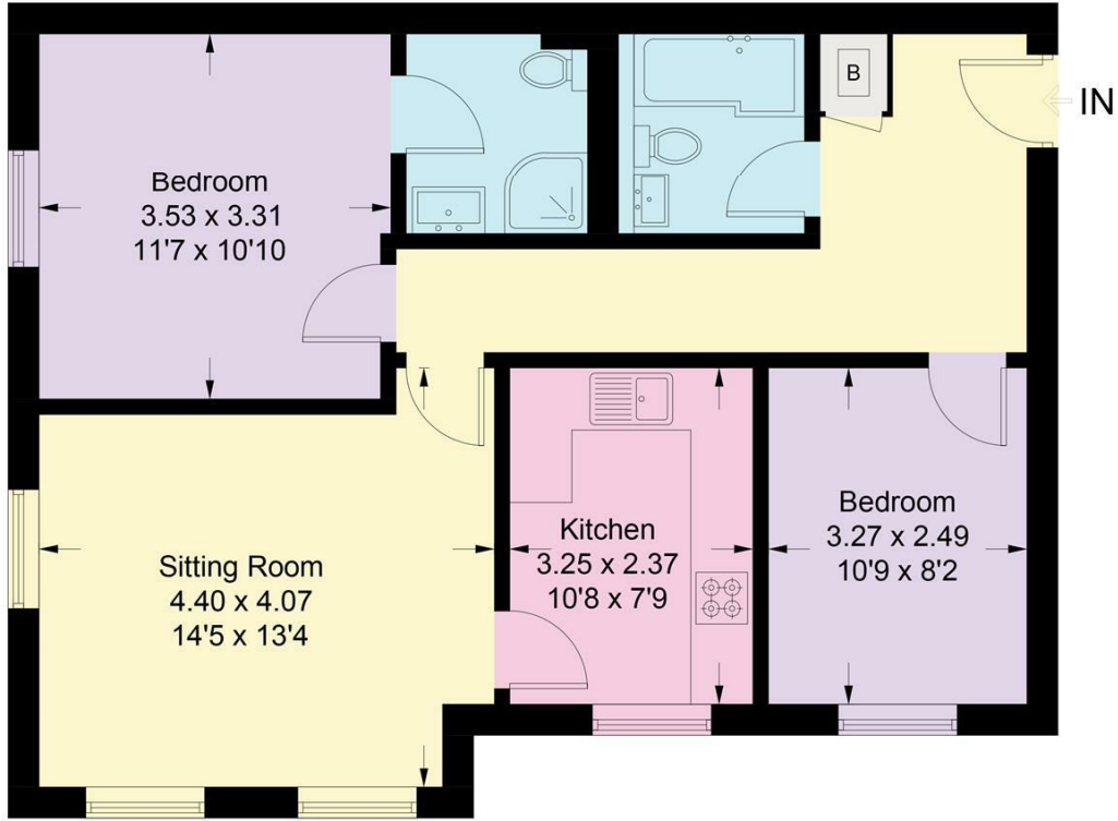
Illustration for identification purposes only, measurements are approximate, not to scale. Fourlabs.co © (ID1270308)

Approximate Gross Internal Area = 65.3 sq m / 703 sq ft