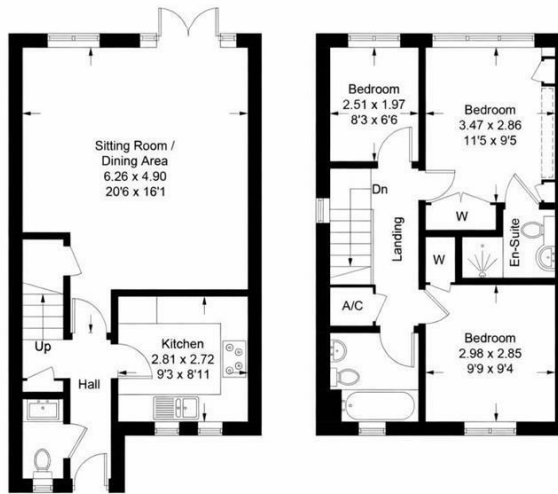
Ground Floor - 43.3 sq m / 466 sq ft